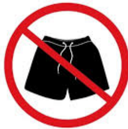
Underwear on show