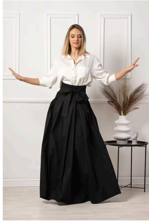
Unsuitable for business - Too long/large