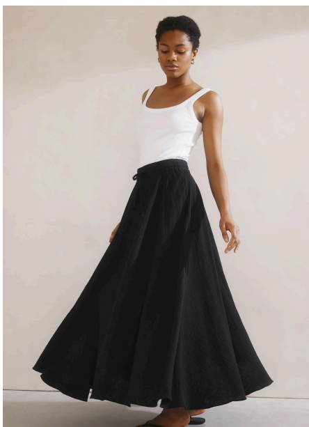
Unsuitable for business