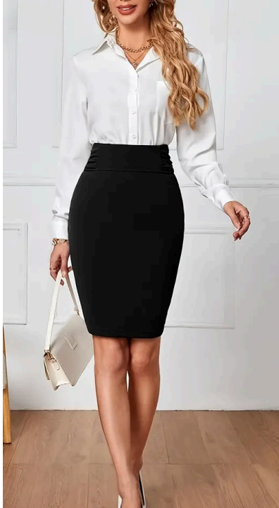
Inappropriate Length (above knee)