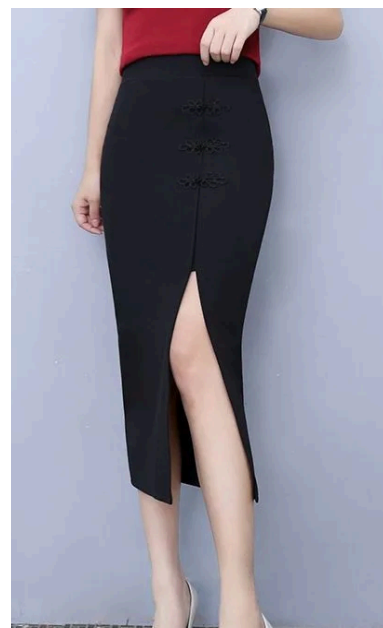
Hem split inappropriate